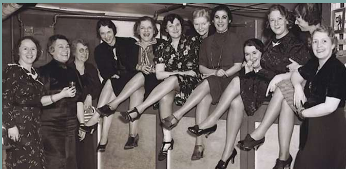
Original members of the club in 1937

Hanoi Vientiane Phnompenh Kathmandu Tashkent Dubai Astana Yangon Ulaanbaatar Male